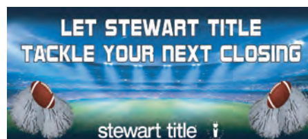
Our 2' x 6' booth horizontal banner can hang on the back of your booth. Single-sided with grommets for hanging. Banner material is heavy duty 13oz. Can be reused over and over. $95.00