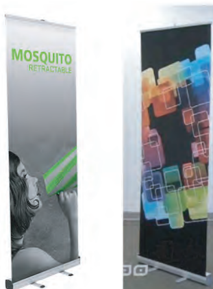
Retractable Banner Stand that can be used over and over. Easy set-up. Graphics included in price. 32" x 82" Includes Carrying Case $185.00