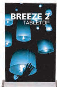
Retractable Mini table top Banner Stand that can be used over and over. Easy set-up. Graphics included in price. 11" x 17" Includes Carrying Case $36.00

$ 25.00 per day x _____ days of event = $ _____